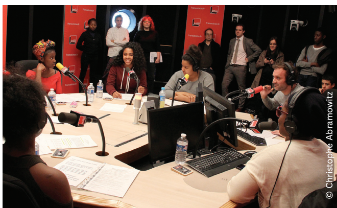
The 'Interclass' project gives teenagers an opportunity to work closely with journalists (here at France Inter radio station) and learn how to analyze and package information.

You can find more details about these projects at www.fondationdefrance.org .