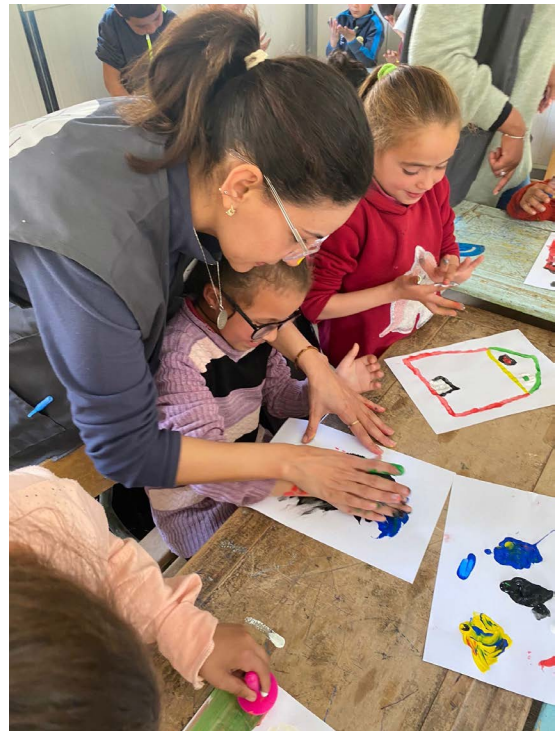
In the villages of the El Haouz region, nonprofit Terra Psy offers therapy workshops for children suffering from psychological and traumatic disorders.

In the Taroudant region, Fondation Amane pour la Protection de l'Enfance (Amane Foundation for Child Protection - FAPE) is rolling out psychological and social support programs in 8 villages covering 250 children, more than 300 women and 350 men. The activities offered to children (drawing workshops and verbalization), women (support groups and psychological support sessions) and men (physical activity and group discussions) enable them to express their emotions, share their experience and re-create community relationships.