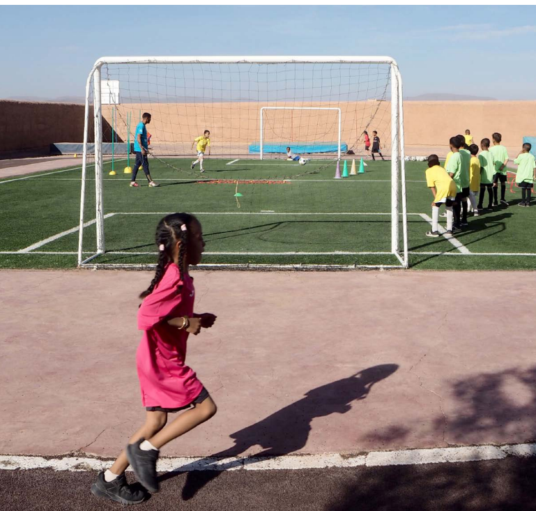
In Ouarzazate, nonprofit Marathon des sables rebuilt the sports center destroyed in the disaster and now welcomes 200 children every day.

The Béatrice Shönberg Foundation is currently renovating boarding schools damaged by the earthquake in Asni, at the foot of the High Atlas. Thanks to the work supervised by Fondation Architectes de l’urgence (Emergency Architects Foundation) , around 50 young women from devastated villages will be able to continue with their studies.