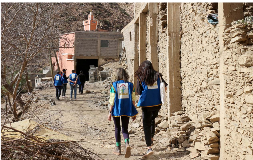
Teams from the Amane Foundation and Fondation de France in the villages destroyed by the earthquake.