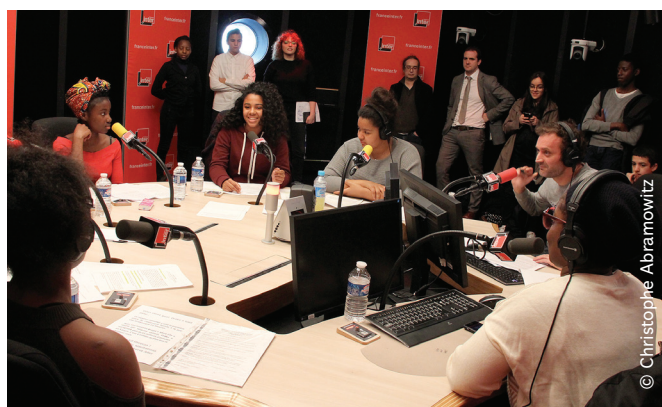
The 'Interclass' project gives teenagers an opportunity to work closely with journalists (here at France Inter radio station) and learn how to analyze and package information.

You can find more details about these projects at www.fondationdefrance.org .