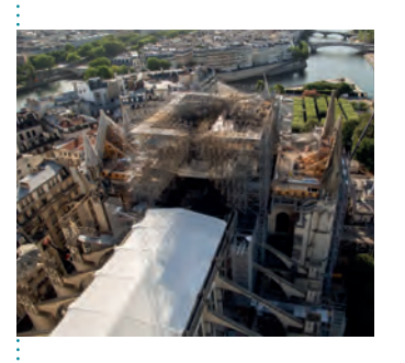
Removal of the former burnt scaffolding

Clearance of surfaces above the arches and inspection of their condition